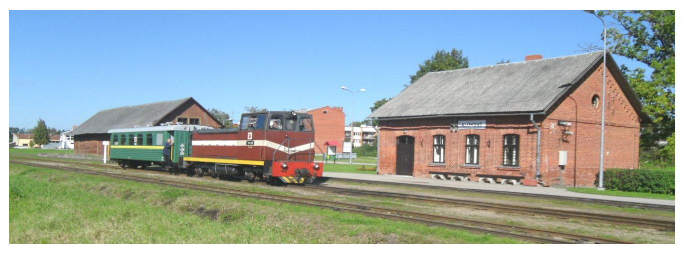
A recent view of Latvia's 'Banitis.'