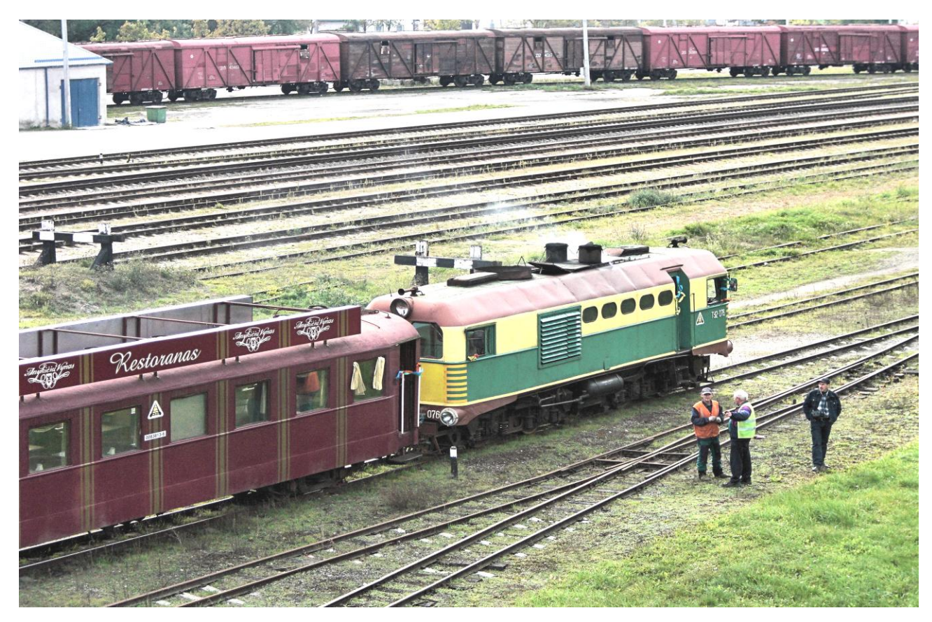
A view of the 'Sweet Narrow' railway in Lithuania, another NERHT interest.

extreme weather conditions! In Latvia we are maintaining our long-established connection with the Gulbene-Aluksne Railway (or Banitis) whose delegates are now with us. Banitis was of course the first railway outside Russia visited by some of the founders of NERHT way back in 1997. In Russia we keep in touch with the Pereslavl Narrow Gauge Railway Museum and have been glad to publish the reports by Sergei Dorozhkov in our magazine Eastern Star .