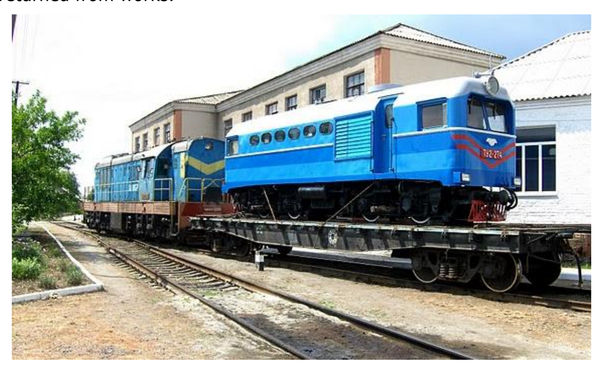
TU2-274 is returned by broad-gauge flatcar after a visit to main works.

Ukraine's Gaivoron line. Rumours about closure plans come in all shapes and sizes, and Eastern Star tries to do some sifting before publishing such forecasts. In our last issue we mentioned a report about the imminent closure of Ukraine's narrow-gauge Gaivoron line. This surprised many of those on the spot, who questioned the accuracy of this report. Our NERHT chairman visited the line in May and found no signs of impending mortality. Indeed, at that very time a newly-overhauled locomotive was being returned from works.